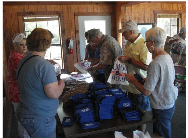
LFSA members getting the goody bags ready for tournament anglers.

The success of the Catfish Classic could not have happened without the support of our member volunteers. From stuffing bags, to manning work stations during tournament hours our members did a terrific job. You all are to be congratulated and thanked for a job well done.