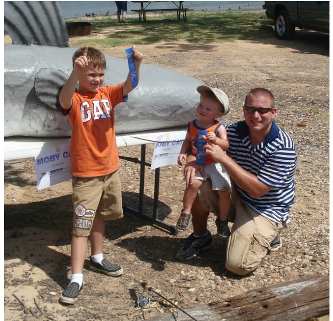
A proud dad with his young anglers and their ribbons won during kid fish at Oak Ridge Marina.